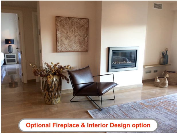
Optional Fireplace & Interior Design option