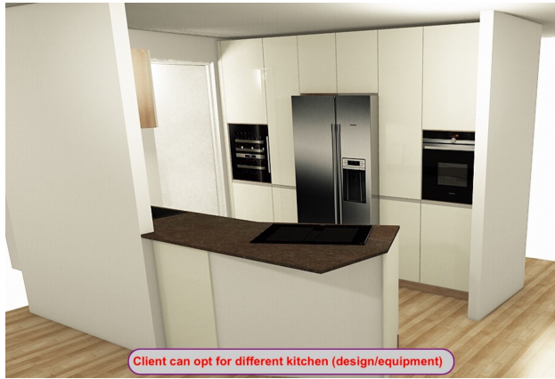
Client can opt for different kitchen (design/equipment)