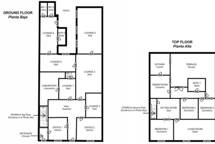
This is a representation of the layout of the property and it is not to scale. Esta es una representación de la distribución de la propiedad y no está a escala.