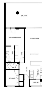
SIZE AND DIMENSIONS ARE APPROXIMATE, ACTUAL MAY VARY