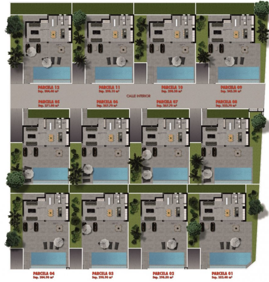
PLANTA BAJA GENERAL (1/250)