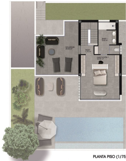
PLANTA PISO (1/75)