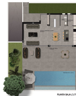
PLANTA BAJA (1/75)