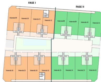
ISO A3 - Escala 1:250