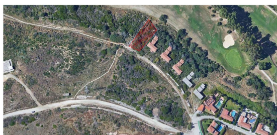
PLANO DE SITUACIÓN