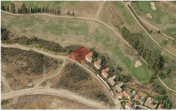
ORTOFOTO VISTA DE PAJARO